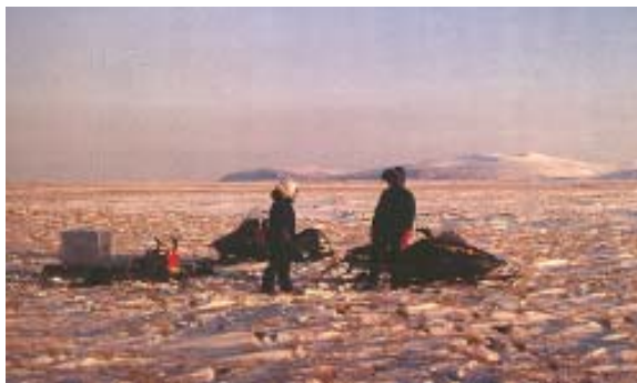
TDEM Groundwater Survey, Hooper Bay, Alaska