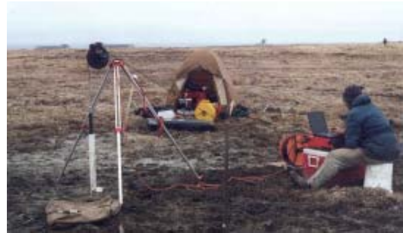
Borehole Conductivity Logging, Shemya Island, Alaska