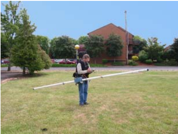
FIGURE 1 - GEONICS EM31

Electromagnetic induction (EM) profiling is a surface geophysical technique used to measure terrain conductivity, a term which refers to the bulk electrical conductivity of subsurface materials. EM conductivity surveying is primarily a tool for rapid lateral mapping of variations in soil conductivity. It is used for mapping lateral transitions in soil type, contaminant plumes, sand and gravel deposits, clay aquitards, and shallow bedrock.