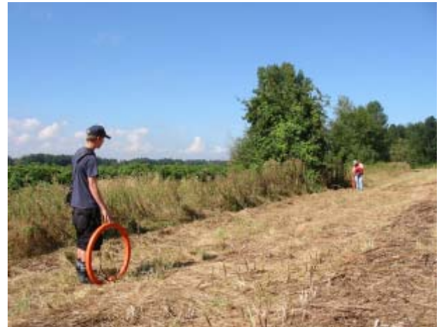
FIGURE 2 - GEONICS EM34-3