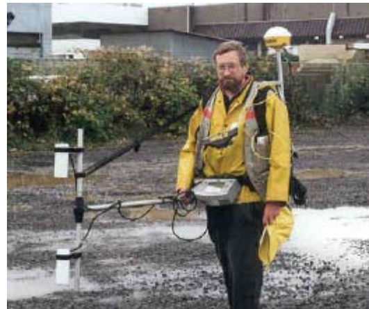
G858g Magnetometer with GPS unit, Portland, OR

Magnetic methods can detect any steel or iron object. The resolution and sensitivity of these methods depend on the size and shape of the magnetic object and the depth of burial.