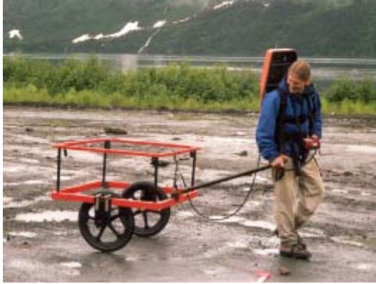
Geonics EM61 "Metal Detector", in Whittier, AK