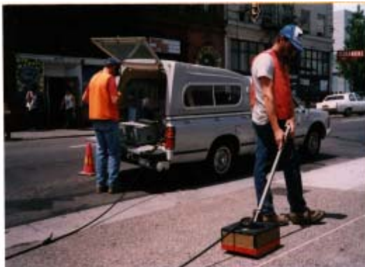
GSSI SIR3 with 500 MHz Antenna, Downtown Portland, OR